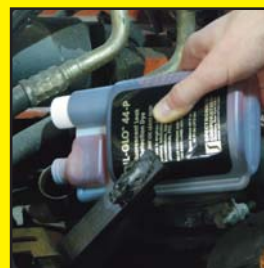
Fluorescent dye is added to the system