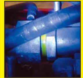
Every leak will fluoresce a brilliant yellow-green, pinpointing the exact source of every leak.