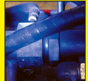
The site is then re-inspected with the lamp. No glow means that all leaks were repaired successfully.