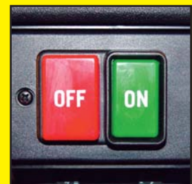
The system is run allowing the dye to circulate