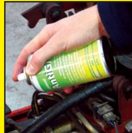
Once repaired, residual dye is removed from leak sites.